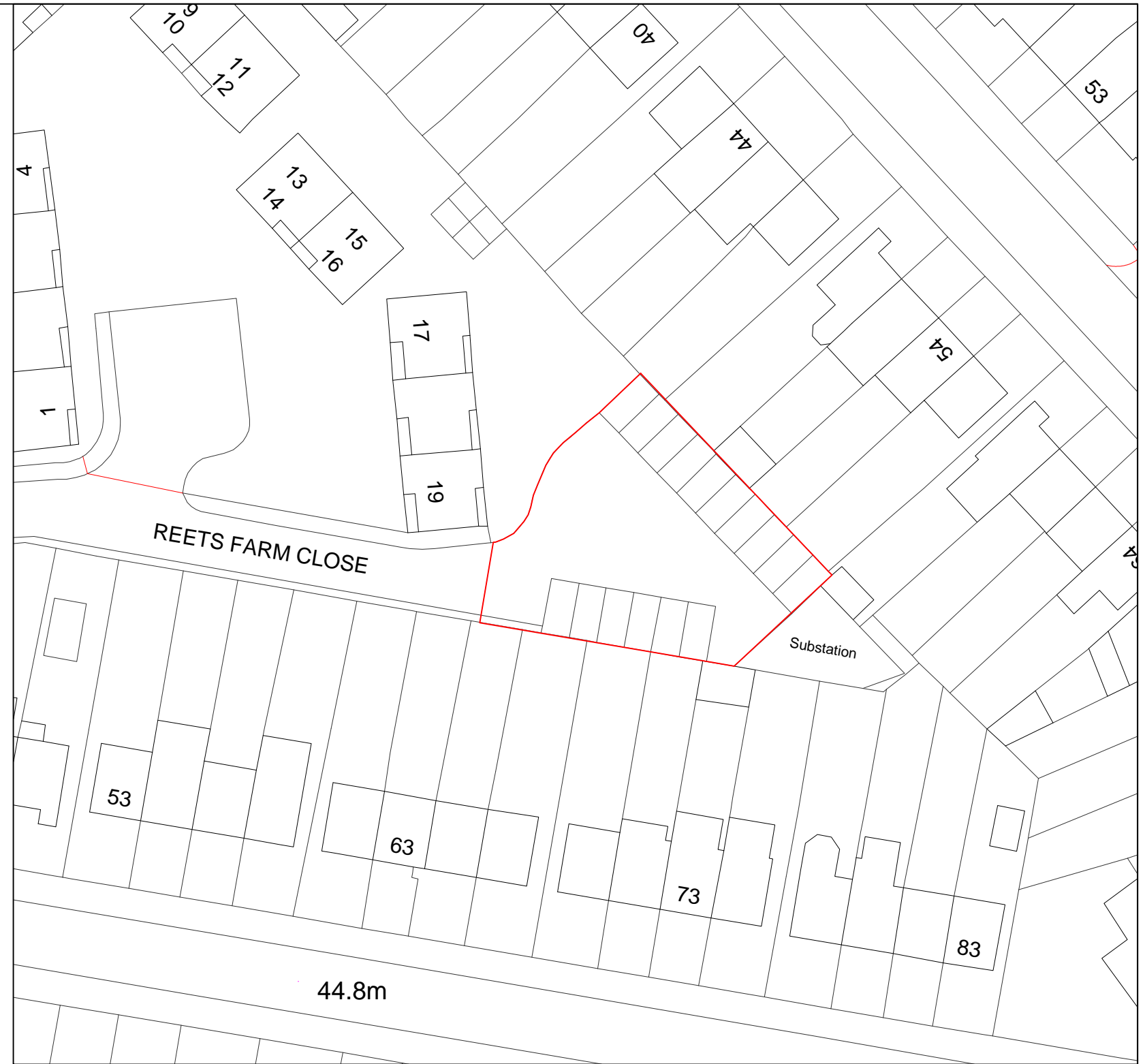
Existing Site Plan 1:500