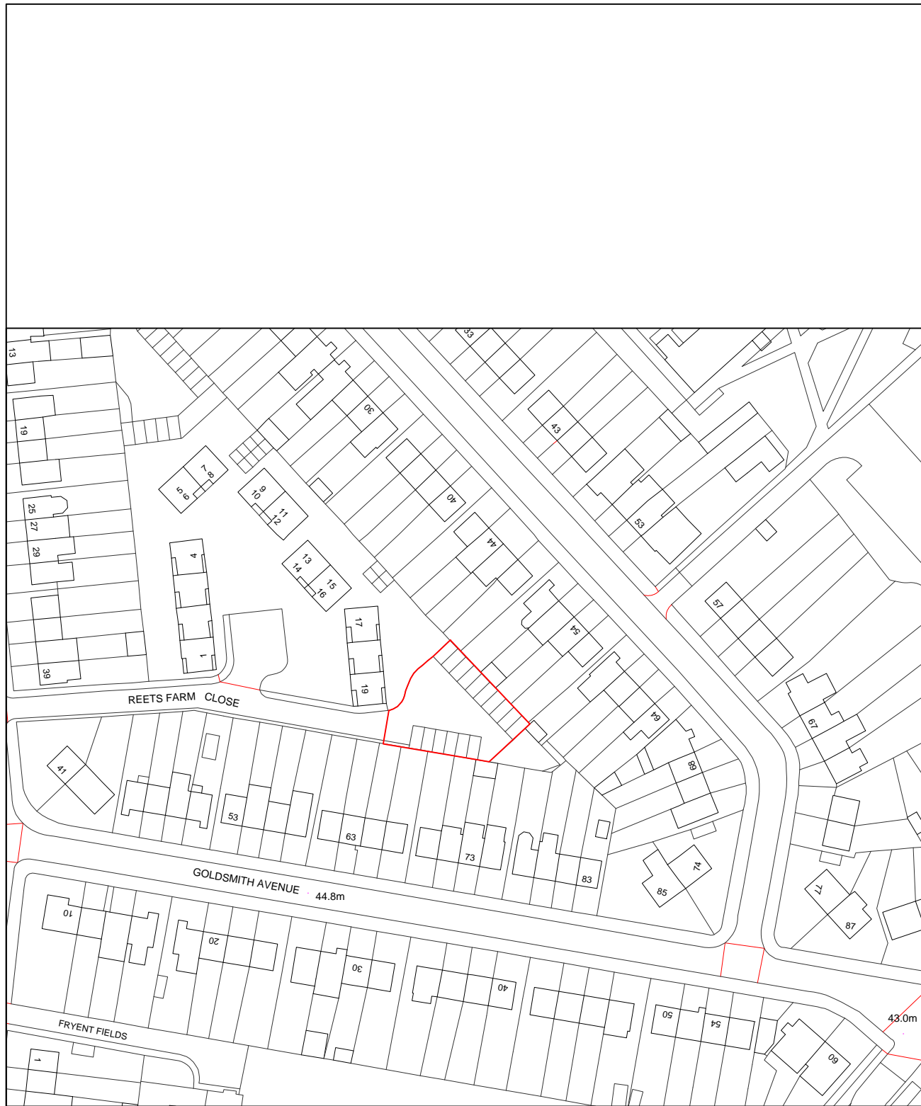
Existing Site Location Plan 1:1250